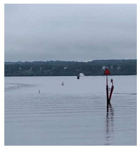
Figure 2: Location of the marker in the channel.

thought that was strange in the middle of the channel.