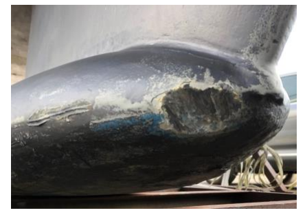
Figure 4: Lead keel impact - That should buff out!