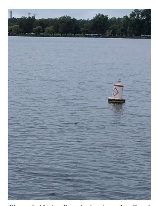
Figure 1: Marker Buoy in the channel at Canal entrance.

Tacking the entire 11 miles back in shifting winds took another several hours. S/V Brewster made it to the finish line as the sun set and increasing rain pelted the crew on deck. We dropped the main and furled that headsail and headed for the Seneca State Park Marina to our slip. It was now completely dark and heavy rain and wind. I could see the two red lights that mark the entrance to the canal – red being on the port side heading to seaward. Keeping those lights in view I noticed a small regulatory floating mark with a small white light on top and